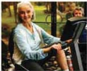
Heated pool, fitness center, steam rooms and more!

Enjoy delicious chef-prepared gourmet meals in our restaurant-style dining room.