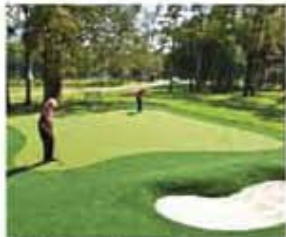
On-premise putting green and free golf at Inverrary Country Club