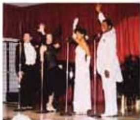
Top entertainment in our Jennie Grossinger Theater